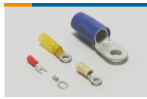
Ring Terminals &amp; Spade Terminals(537)